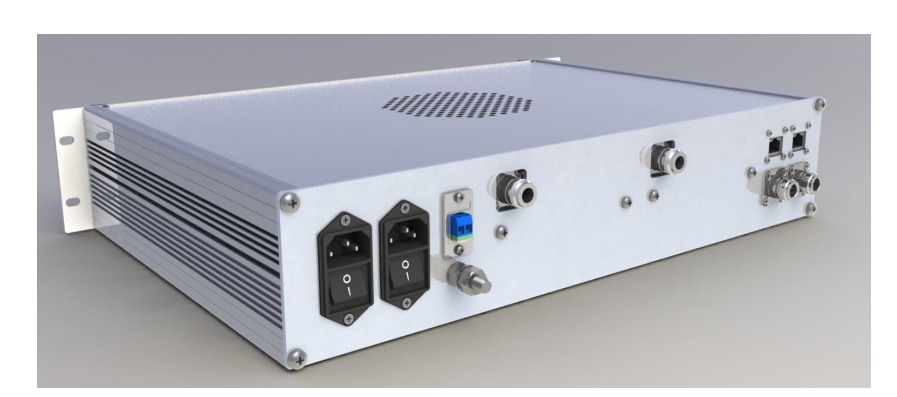
Fig.1 - PlaneTRack ADS-B Receiver Type RDM rear view